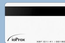
P30DMG Dye-Sub Card with Mag Stripe