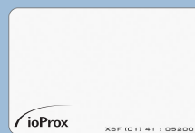
P20DYE Dye-Sub Card