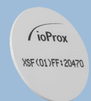
P50TAG Self-Adhesive Tag